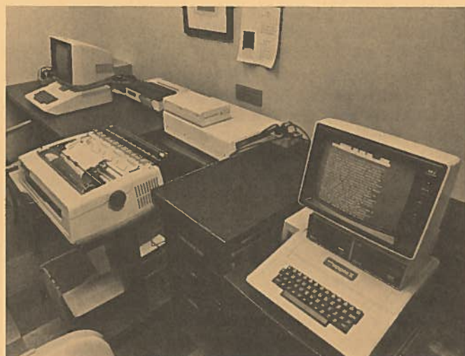
The Clark's microcomputer system, phase two.