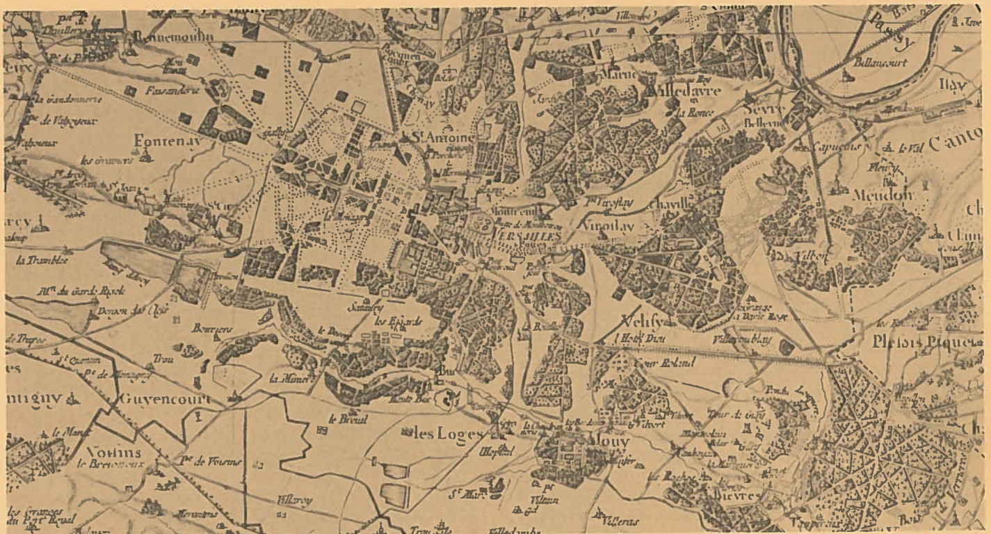
Detail from a topographic map of Paris and its environs, showing the area surrounding Versailles. From Carte de la France , Paris, 1750-87.

At the request of Jean Baptiste Colbert, and with the support of King Louis XIV, the Académie, under Cassini (after 1673, called Jean Dominique), undertook to create a detailed and accurate map of France in multiple sheets, employing uniform standards and symbols. The first step was to measure the arc of the meridian of Paris and to ascertain the length of a degree of latitude. A number of well-known scientists contributed to this work, including l'abbé Jean Picard, Gabriel-Philippe De la Hire, and Giovanni Domenico Maraldi. The coasts were first surveyed and a triangulation network developed over a large area. The apparent reduction of his territory by means of accurate coastal charting led the king to remark that the survey had cost him more land than a disastrous campaign. The meridian was extended from the Channel to the Pyrenees and a triangulation network developed over a large area. This project, which was accomplished with the aid of special optical instruments, became the basis of more accurate topographical