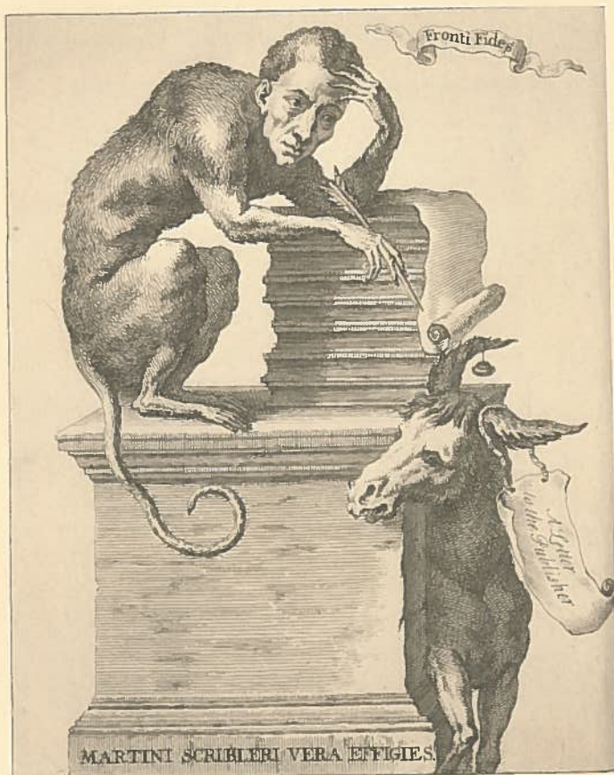
Frontispiece to Pope Alexander's Supremacy and Infallibility examin'd (1729)