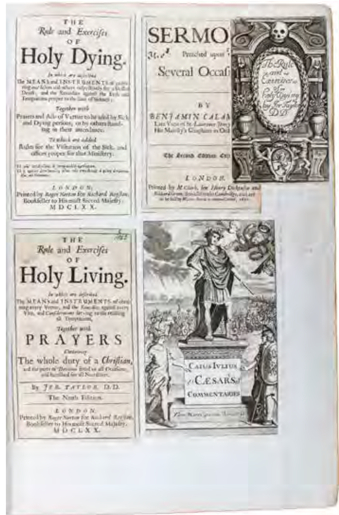
Scrapbook collection of title pages . . . Clark f MS.2007.011

The early modern period also witnessed the rise of new forms of textual and physical collections. Forerunners to the modern museum emerged as wunderkammern , or “cabinets of curiosity,” which were eclectic and relatively disorganized assemblages of natural history specimens and antiquities (including statuary, coins, medals, and human artifacts). These physical archives—as well as their printed catalogs—emphasized the eclectic juxtaposition of objects in wunderkammern , usually reflective of a collector’s wide-ranging tastes and interests. A related genre is the album amicorum (album of friends), a blank notebook carried by travelers and students in Europe for the purpose of soliciting inscriptions, signatures, verses, and other textual scraps from colleagues, friends, and eminent persons. Surviving specimens of alba amicorum are often quite complex in structure, bringing together manuscript texts in multiple hands and in some cases combining them with cut-and-pasted images from printed books (such as emblems or printers’ ornaments). The early modern period also marks the heyday of the engraved print, and many collectors mounted and bound up their cuttings of prints in custom notebooks. Most notable among the many surviving examples of broadside ballad collections are the