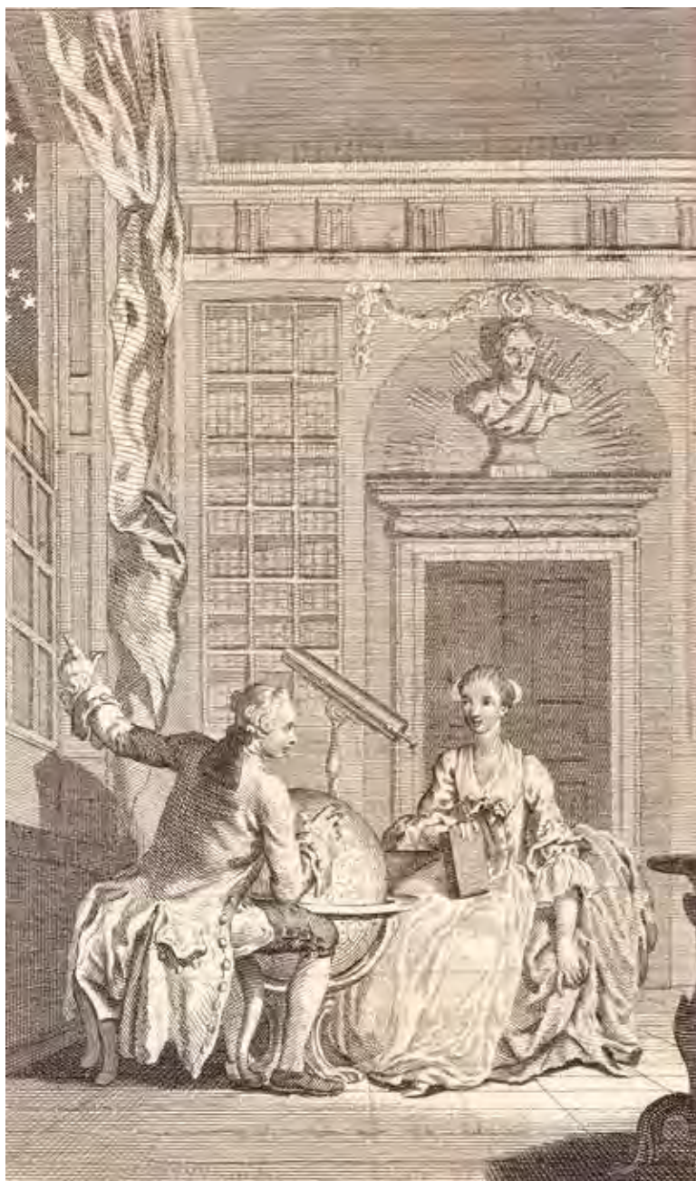
Frontispiece from Benjamin Martin's The Young Gentleman and Lady's Philosophy (London: W. Owen and B. Martin, 1759-63) Clark Q157 M37 *