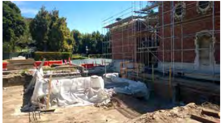
New basement pavilion, 23 March 2016