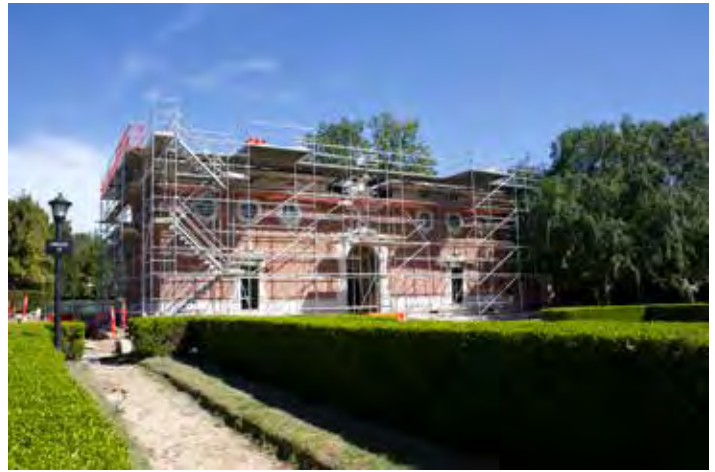
Scaffolded Clark Library and walkway, 23 March 2016

The seismic retrofit of the Clark Library has passed its midway point. Construction highlights in this penultimate report include the following.