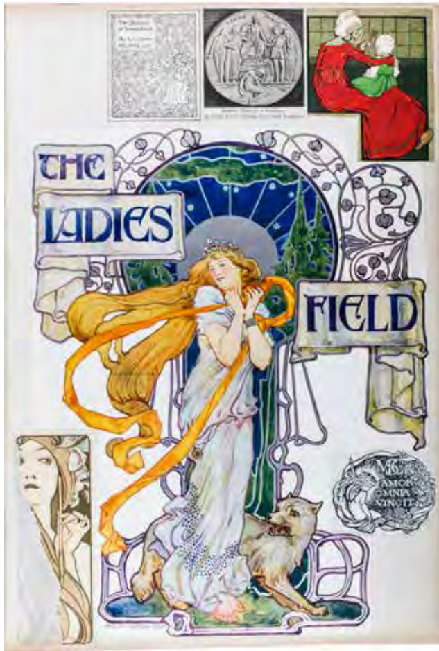
Aymer Vallance Scrapbooks, ca. 1890–1900 Clark f MS.2011.010

textual excerpts, many of which are arranged on themed pages. There are entire leaves, for instance, devoted to images of big cats, ships, and dragons, the last of which features advertisements, engravings, coats-of-arms, bookplates, and even a photograph. Many pages are graced by full-color cover images from late nineteenth-century periodicals, including the vibrantly colored cover of The Ladies Field (issue dated 1903). Other leaves emphasize typography, as on the pages filled with ornamental initials taken from facsimiles of early books spanning several centuries. Many of the cut-and-pasted pieces have been annotated by Vallance. He left a note to accompany a drawing of a pomegranate, for example, that reads: “Pomegranate from leather binding of a panegyric of Cardinal Wolsey, in the Bodleian Library, Oxford, 16th century.”