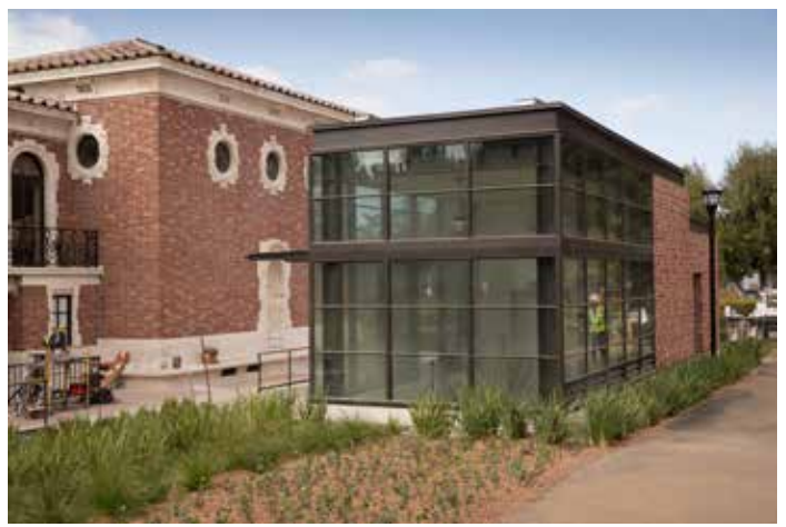
The new pavilion on the north side of the Clark Library

While all this is being completed, the research and cultural activities of the Center continue unabated. This summer was a particularly trying time for the Center staff, as they packed everything and moved their offices down the hall from their old home to 302 Royce, where they now occupy the upper level of a suite shared with the Center for