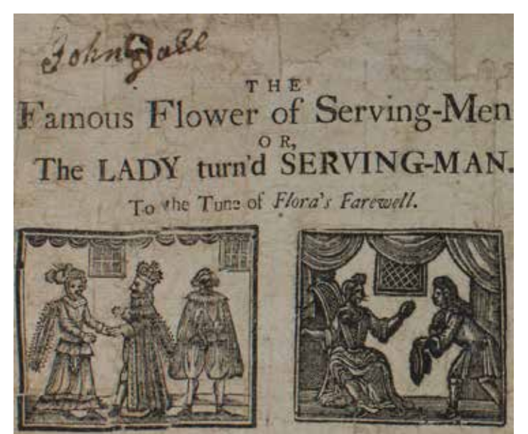
The Famous Flower of Serving-Men: or, The Lady Turn'd Serving-Man (London: Printing Office in Bow-Church-Yard, 18th century)

Proposals from the Sun-Fire-Office (London: Printed by R. Nutt, 1766) Rare Book Stacks, f HG9669 .S95 1766 *