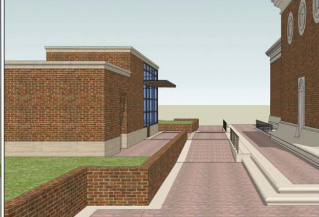
Clark Pavilion Renderings