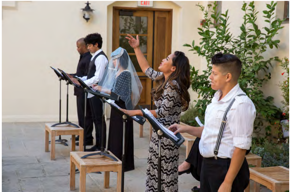
Golden Tongues 3, Playwright's Arena, 2015.