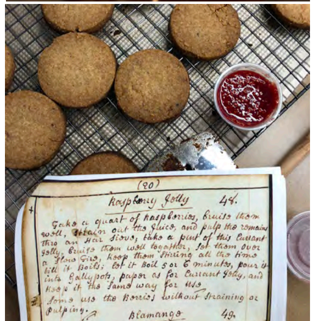
Participants in the Clark’s inaugural workshop made Early Modern sugar cakes and raspberry jelly.

of their own assumptions and experiences about taste. The show is funny, honest, and a fascinating example of how libraries can facilitate encounters with the archive that aren’t necessarily aesthetically beautiful (or predictable), but instead throw light on neglected materials that may initially inspire revulsion or disgust. As an exemplar of how such recipe revival can function as a mode of library outreach, Bad Taste has been selected for presentation at the American Society for 18th-Century Studies Conference in 2021.