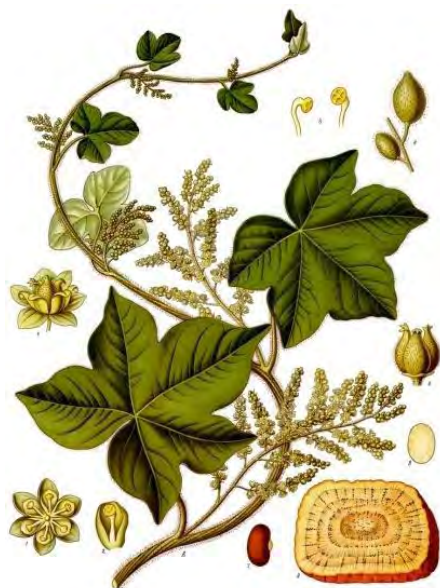
Jateorhiza palmata, from Franz Eugen Köhler, Köhler's Medicinal-Pflanzen, 1897.