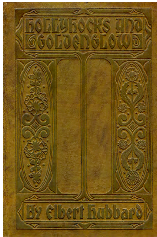
Cover, Hollyhocks and goldenglow, Elbert Hubbard, 1912.