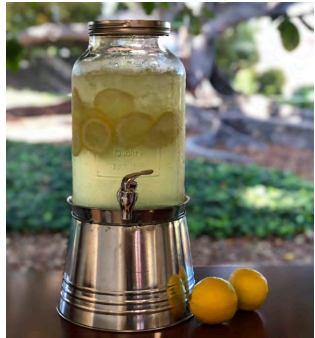
Attendees of the Clark’s Antique Ice Cream Social enjoyed lemonade from an Early Modern recipe, made with hand-squeezed Clark-grown lemons.

Pies and sugar cakes are undoubtedly delicious, but increasingly, Head Librarian Anna Chen and I found ourselves drawn to historical recipes that weren’t appealing to the modern palate. We knew what apple pie tasted like, but what about squirmy pickled walnuts? Wobbly cucumbers fried in gravy? Viper broth?! This curiosity inspired the Clark’s first-ever online video series: Bad Taste . In the show, we detail the process of recreating and tasting a historical recipe which seems “disgusting” to the modern palate. Onsite guests, from Clark fellows to reading room staff, bravely serve as “tasters” by eating the concoction, noting their reaction to it, and actively unpacking the underlying logic